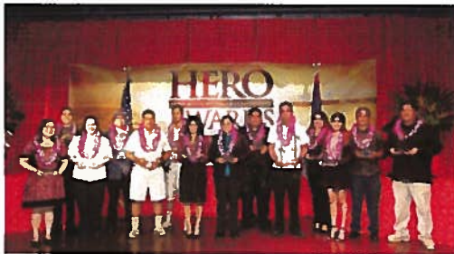
GVB and GHRH hosted the annual Hospitality Employees' Outstanding (HERO) Awards ceremony at the Hilton Guam Resort and Spa on July 28, 2017. Out of 79 total nominees, 16 winners were selected from seven different categories: Hotel Aisle Staff, Rockstar of the Year, Middle Management Supervisory, Non-Supervisory, Life Saving and Integrity.