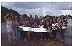
PATA MICRONESIA CHAPTER 3 RD TRI-ANNUAL MEETING – PALAU NOVEMBER 13-14, 2017