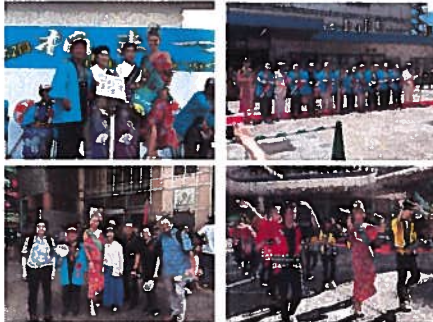
42 nd Kashiwa Festival July 27, 2019 | Kashiwa, Japan