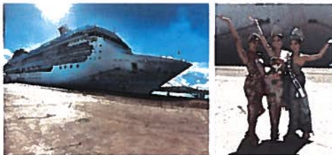
The Coral Princess Cruise ship docked on Guam on November 4, 2018 & welcomed 1,950 passengers and 890 crew members to the island.