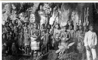
Carolinians lived in Tamuning after a 1849 typhoon devastated their homeland. Tamuning may have been derived from a Carolinian word or may be the name of the Carolinian clan's name that settled there.

"Tamuning" is a Carolinian word which was given to the area where Carolinians settled beginning in 1849 after a typhoon devastated Lamotrek and Satawal. It may be that Tamuning is the name of the Carolinian chief's clan. The American administration relocated the Carolinian population of Tamuning to Saipan in the early twentieth century. Another name for Tamuning during the nineteenth century was Maria Christina. The ancient Chamorro name for the area was "Apurgan" or "Apotgan"