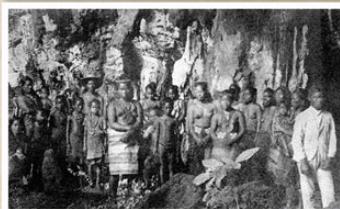
Carolinians lived in Tamuning after a 1849 typhoon devastated their homeland. Tamuning may have been derived from a Carolinian word or may be the name of the Carolinian clan's name that settled there.

"Tamuning" is a Carolinian word which was given to the area where Carolinians settled beginning in 1849 after a typhoon devastated Lamotrek and Satawal. It may be that Tamuning is the name of the Carolinian chief's clan. The American administration relocated the Carolinian population of Tamuning to Saipan in the early twentieth century. Another name for Tamuning during the nineteenth century was Maria Christina. The ancient Chamorro name for the area was "Apurgan" or "Apotgan"