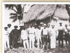
Ypao Leper Colony at Tumon, Guam.