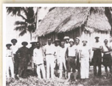
Ypao Leper Colony at Tumon, Guam.