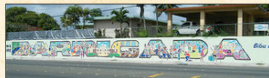
Barrigada Mural.