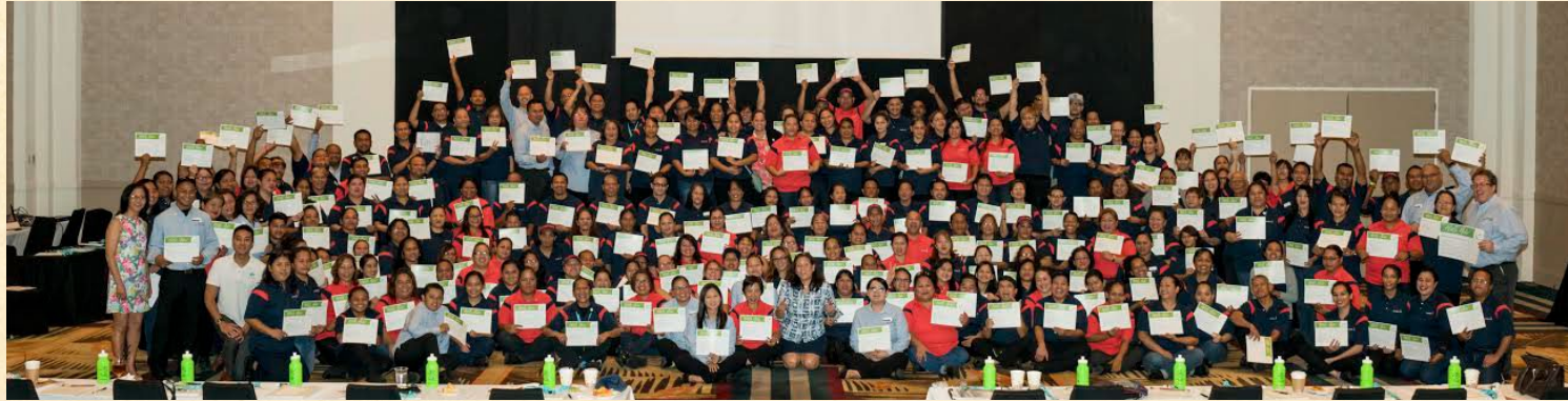
More than 200 Sodexo Food Services employees commit to serving Guam's schoolchildren with the Håfa Adai Spirit.