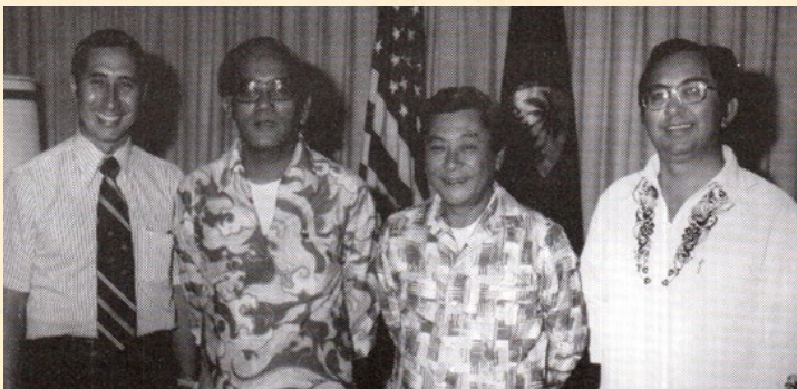
From left to right: Kurt Moylan, Ricardo Bordallo, Carlos Camacho and Rudolph "Rudy" Sablan.

Governor Camacho's Visit to Vietnam, 1970. Governor Camacho, dressed in a Green Beret uniform, rides a tank during his Christmas visit to Vietnam to visit Guam military members.