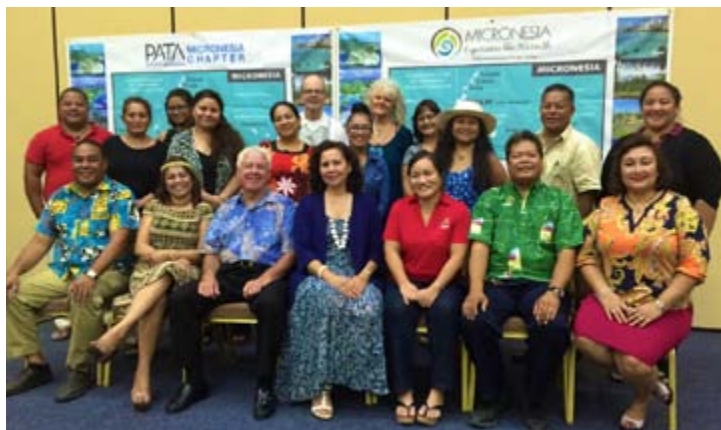
PATA Micronesia Chapter members gather for a committee meeting day at the Majuro International Convention Center on April 7, 2015.