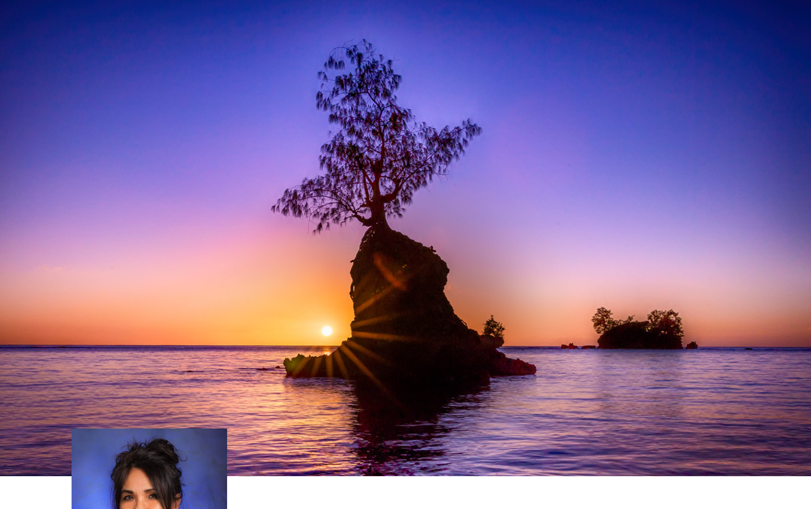
ROSE Q. CUNLIFFE Controller