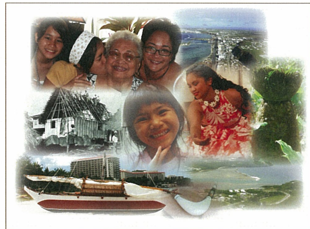
Picture bringing it all together in a brand image for Guam that captures the clean, simple, refreshing and aspirational essence of our island, our people and our cultural heritage.

The space relationships between all the elements of the signature is an important aspect conveying the airy open feel of the Guam experience, the aspirational nature of a bold and refreshing look to the future.