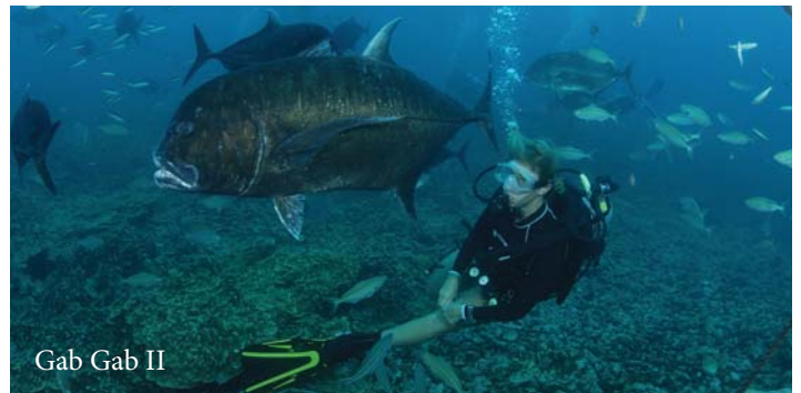
Gab Gab II

The main dive site of the Atlantis Submarine, Gab Gab II is a great place to see large schools of trevally. Fish feeders that work daily to entertain submarine guests also give divers up close and personal encounters with large life among coral encrusted pinnacle and sponge formations. Lower areas of the reef have large blue elephant ear sponges hosting small goby fish, as well as dripping vase and round barrel sponges. Near the feeder buckets, divers can see a massive eel, hawksbill turtles, and an occasional nurse shark. Depth ranges from 36 to 70 feet.