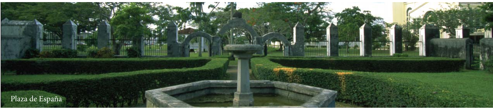
Plaza de España