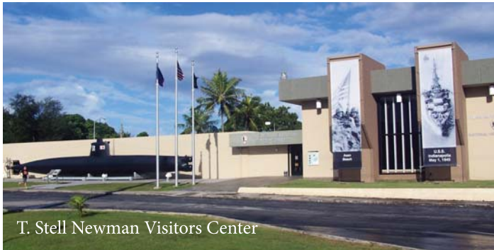
T. Stell Newman Visitors Center

Information about each of Guam's historical WWII sites is listed below. Each offers a unique perspective on the war.