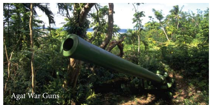
Agat War Guns

Counterattacks around the American beachheads quickly took their toll on the Japanese. In early August 1944, they were running out of food and ammunition and had only a handful of tanks left. Japanese Lt. Gen. Hideyoshi Obata - a longtime member of the Japanese army - withdrew his troops from southern Guam, and planned to make a