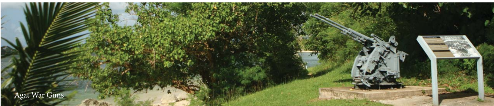
Agat War Guns

Home to several caves, bunkers, and more than 10 pillboxes, Agat features Ga'an Point, Bangi Point, Apaca Point, and Bangi Island.