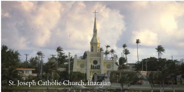
St. Joseph Catholic Church, Inarajan

Located on Naval Base Guam, the War Dog Cemetery honors canines who flushed out the enemy's hiding spots during Guam's liberation by American forces. Previously located in Yigo, the cemetery was moved to the base in 1994. Breeds primarily used to scout out enemy hiding spots included Doberman Pinschers and German Shepherds.