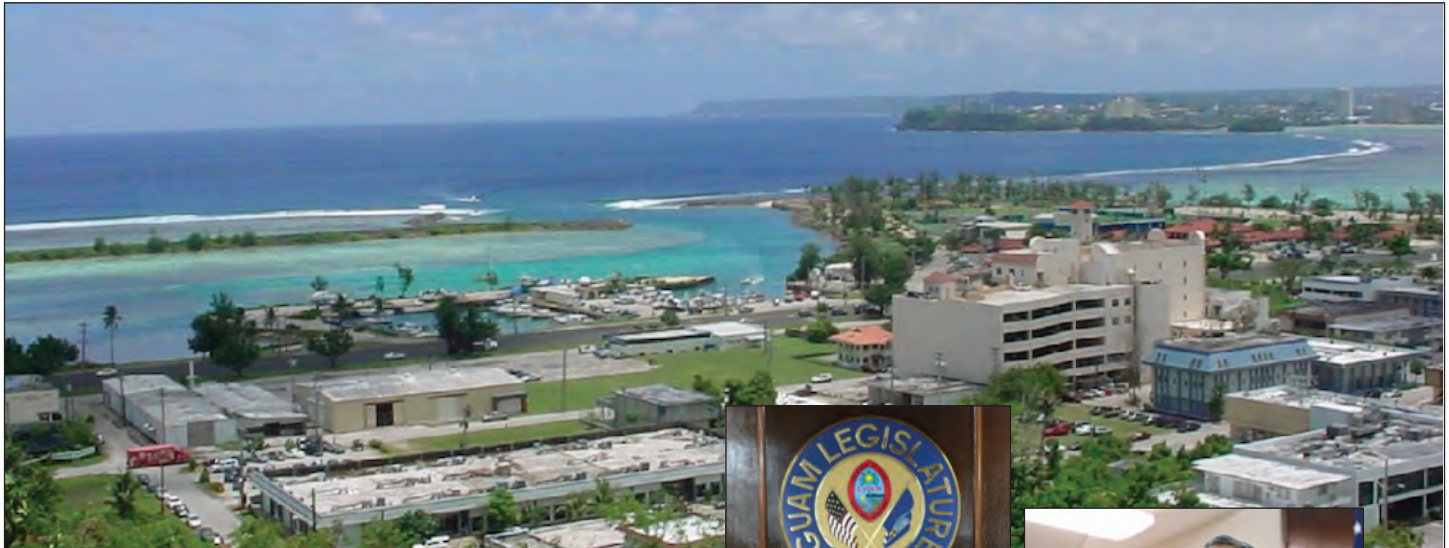
View of Hagåtña, Capitol City of Guam.