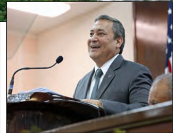
Governor Eddie Baza Calvo delivering his 5th State of the Island Address on February 16, 2015.

FestPac, next year, we're going to open Hagåtña to them. A revamped Paseo Park will be the center of the festival, which we anticipate will host about 2,500 artisans along with an estimated 10,000 supporters from more than 27 countries in the Pacific region. As our guests tour Hagåtña, they'll see the Cathedral, the new Guam museum at Skinner Plaza. In the corner between them, is the site of the old Plaza De España — restored to become a glowing reminder of Sunday afternoons when musicians played in the courtyard of the palasio, while families strolled by listening to the music.