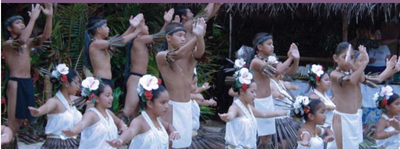
Inetnon Gef Págo dancers perform at Fiestan Dinaña' Minagof Chamorro Dance Festival in 2009. The annual event will be held from Feb. 12-13, 2011.