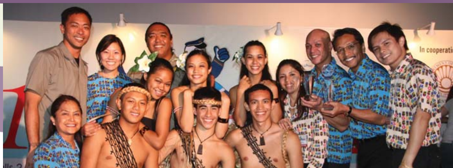
GVB staff and Inetnon Gef Pa'go dancers display awards from the 2010 PTAA in the Philippines.

Click here to learn about more free downloadable tools.