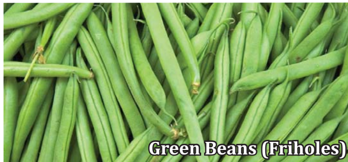
Green Beans (Friholes)