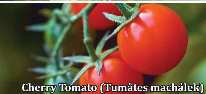
Cherry Tomato (Tumåtes machålek)