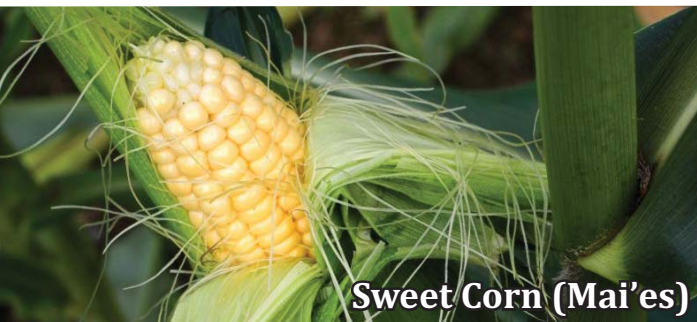
Sweet Corn (Mai'es)