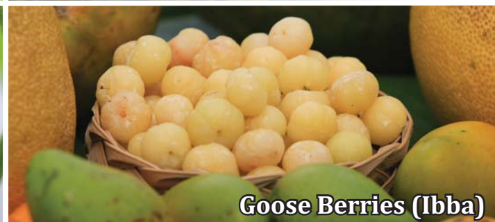
Goose Berries (Ibba)