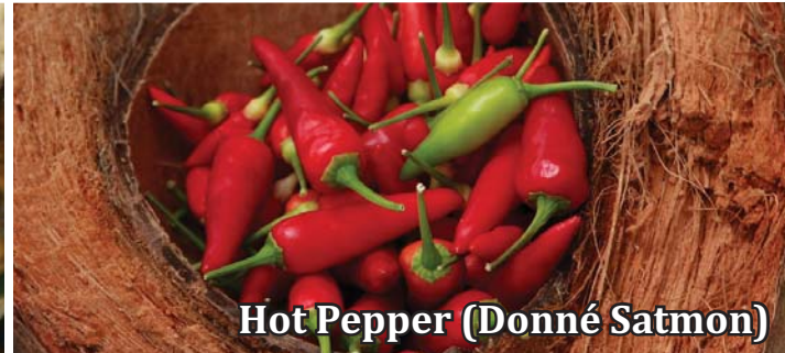
Hot Pepper (Donné Satmon)