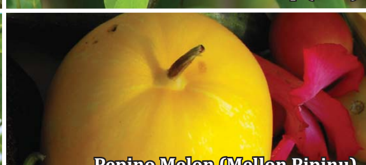
Pepino Melon (Mellon Pipinu)