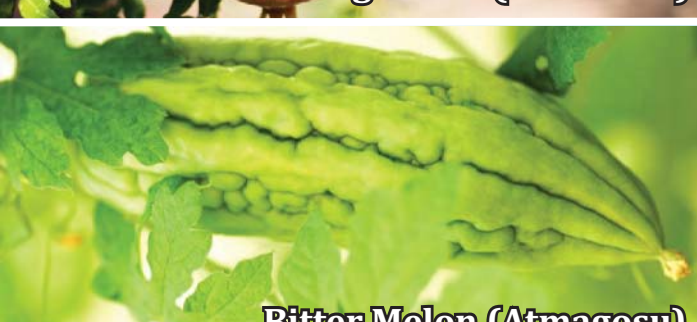
Bitter Melon (Atmagosu)