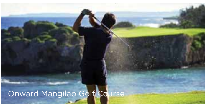
Onward Mangilao Golf Course

Golf: A round of golf at one of Guam's many courses is an opportunity well worth the effort. Seven courses ranging in environment and difficulty level are situated throughout the island, many of which were designed by golfing greats Jack Nicklaus and Arnold Palmer. A golf driving range, located close to Tumon (Guam's hotel district), is open until 10 p.m. Golf clubs, shoes and other equipment may be rented at the pro shop. The island boasts top level golf courses - most with 18 holes - with pro and specialty golf shops at each respective clubhouse.