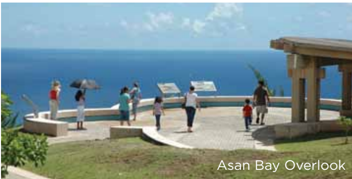
Asan Bay Overlook

Asan Bay Overlook - This site provides visitors with virtually the same view the Japanese had of Apra Harbor as U.S. Forces arrived on Guam. Visitors can learn about