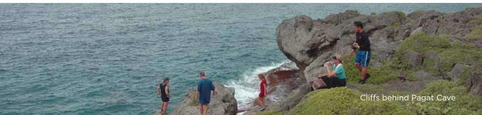
Cliffs behind Pagat Cave