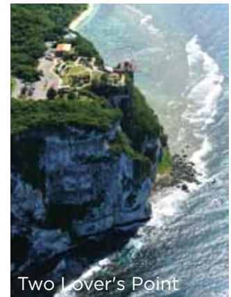
Two Lover's Point

A favorite among visitors, Two Lovers Point offers a breathtaking view and a look into the culture and history of the island. According to ancient folklore, two ill-fated lovers who had been forbidden to marry tied their hair together and leapt to their deaths from this 378-foot-high cliff.