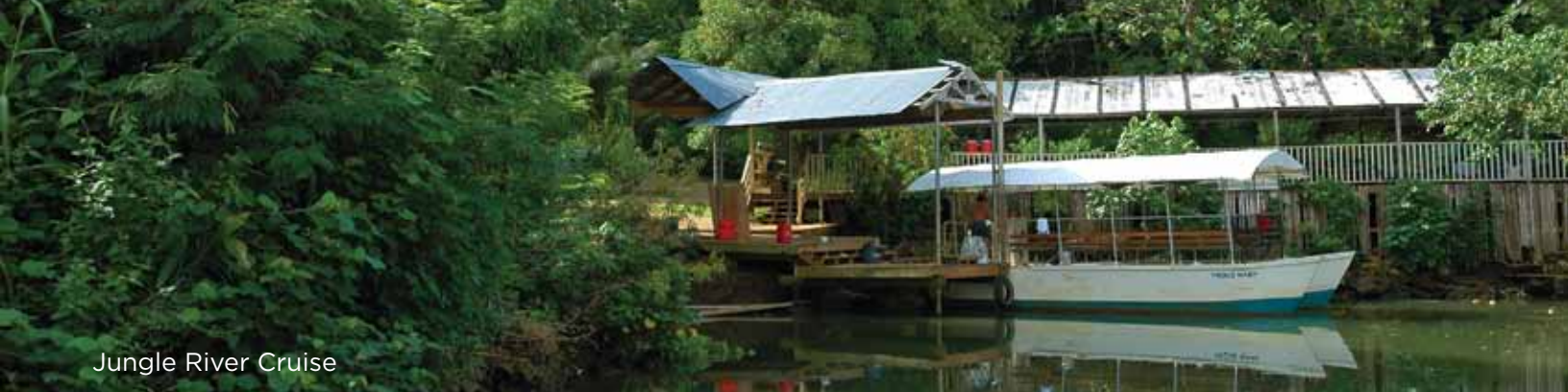
Jungle River Cruise