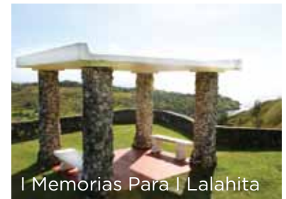
I Memorias Para I Lalahita

I Memorias Para I Lalahita - Dedicated in 1971 to the Guam men who died in Vietnam, this site offers an unmatched view of Guam's southern mountains. A 2-foot wall surrounding the memorial allows you to sit and admire waterfall valleys, mountain ranges and Umatac village below.