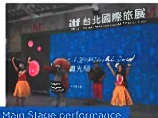
Guam delegation at the ITF opening ceremony/ Guam booth/ Main Stage performance