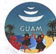
Key visual mock-up