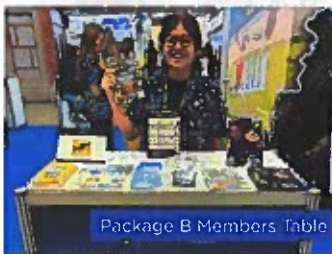
Package B Members Table