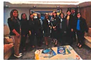
GVB met with TVA in April 2025 during the inaugural launch of the TPE-GUM direct flight mission.