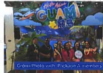
Group Photo with Package A members

2025 Taipei International Travel Fair (ITF) | 2025年台北國際旅遊展 (ITF) | 2025年台北國際旅遊展 (ITF) | 2025年台北國際旅遊展 (ITF)