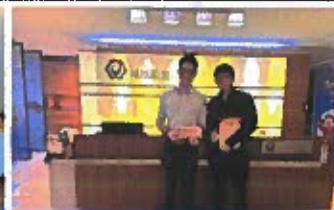
GVBT delivering CNY coupon packages to partner agencies.