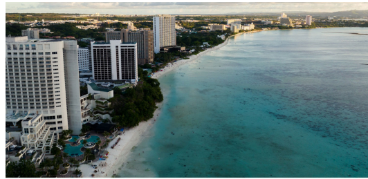
INDUSTRY REPORT AUGUST 8, 2025