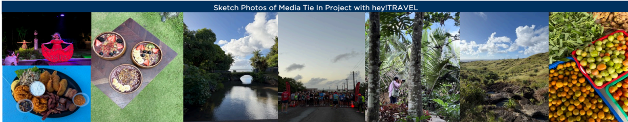
Sketch Photos of Media Tie In Project with hey!TRAVEL