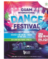
Sketch Photos of NPher Performance at GIDF