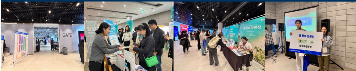
2025 25 th E:DM International Education Fair Sketch Photos