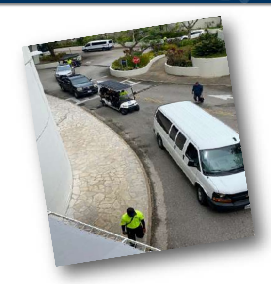
VSOs monitoring beachside