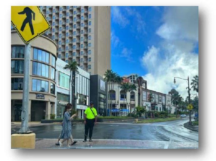
VSOs increasing foot patrols and presence to assist visitors